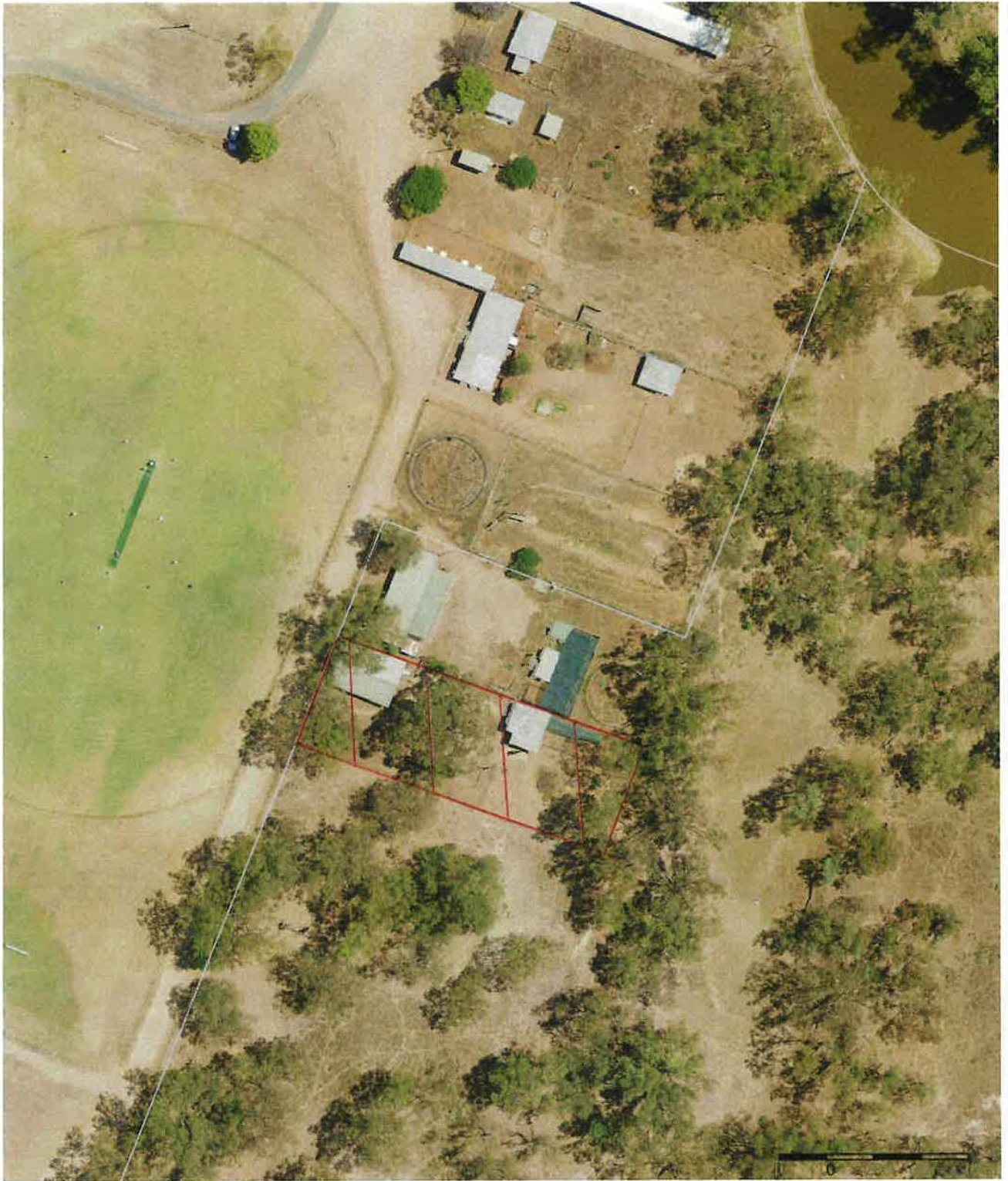
DIAGRAM SHOWING LICENCE AREA BY RED HATCHING