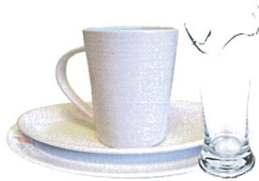
Ceramics, Pyrex & Drinking Glasses