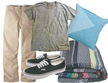
Clothing, Shoes & Bedding