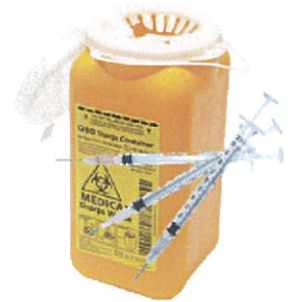
Syringes & Medical Waste