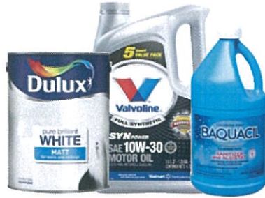
Paints & Chemicals