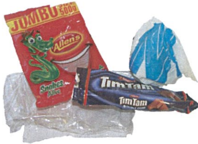
Plastic Bags & Packaging